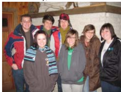
Last year's very fun Barakel College group!

and harassment. You bring a pop or some kind of munchy or baked treat plus $2.00 for when we make a food run. I will bring the cards, score sheets, the rules and of course, my mastery of the game. The trophy has been dusted off and is ready for it's new home. Who will carry away the coveted plank with it's golden players? This is a great event to bring a friend or two. Bring some other games for later after the trophy presentation. Hilarity will abound.. see ya there. Oh... have you registered for Barakel yet? I need a count so I can arrange rides. You pay your own fees plus $10 for gas and you'll need money for a dinner stop on the way up. Broom ball, tubing, late night walks on snow covered lakes... Starts New Years day, leaving at 3 pm and returning Sunday afternoon.