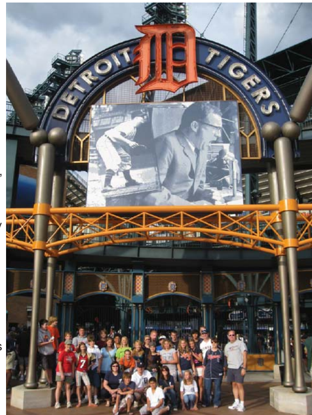
Here we are at the Tiger game on Aug 5. Hey all you JR HI'ers ... see those two black & white pictures below the Detroit Tigers sign? His initials are GK and it's on a flag in centerfield. Who is he? :-)

Coming off our first Varsity championship in 15 years, we are excited to start another quiz season. And there is room for you, oh JR HI (6th-8th grade) or SR HI student (9th-12th grade), on a bible quizzing team for the upcoming 2009-10 season (the books of 1 & 2 Corinthians ... very short amount of material ... it's a great year to try it out). Have you ever felt like you didn't know what to do for your daily devotional time with the Lord? Why not slowly memorize an entire book of the Bible? That's right, over the course of 6 months, actually put God's word in your brain and you'd be amazed at what He will do to your heart! Parents or students ... this is a great way to challenge you in your spiritual growth and do something that counts for eternity! If you have any questions, please see