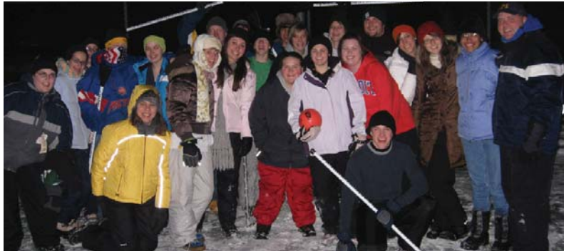
The Barakel 2008 championship broom hockey team from Fellowship Chapel! We hope to repeat the success this coming year as well.

I know for many of you, life this past week involved finals. So how did you do? Hopefully decent enough not to get grounded from Wednesday nights!! And were you thankful for that "cold" day off on Friday. (I will not insert that line about how they never closed school for cold temperatures when I was in school ... oh wait ... I just did.) Regardless of the temperature, we're still engaging in some Real Life this Wednesday night at 7pm. Be there each and every week. Last week we talked about where doubts should lead us ... to the same reaction that Thomas had ... "My Lord and my God!" We'll be having some fun, catching up with one another, and finding out a little bit more about who we are and who God is and how it connects with your life. Be there!