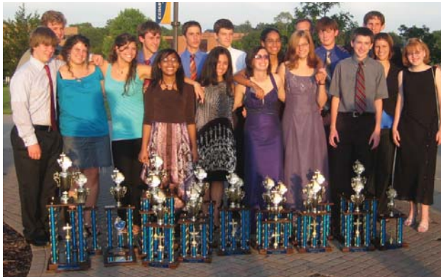
All 3 world teams from Detroit with their well earned trophies after the end of the tournament banquet.