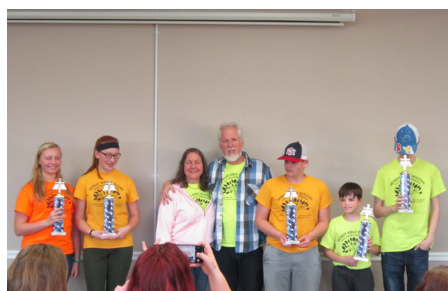
The 2019 GLRT Champions