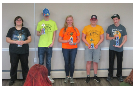
All Stars 8, 7, 4, 2 and 1