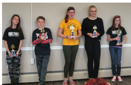
All Stars 10, 9, 6, 5 and 3

None of the Detroit groups had four quizzers going to Great Lakes, so to make four-person teams everyone had to work together. Two Lake Pointe quizzers joined three from Heart to form DBQ We Are His House. Another Lake Pointe quizzier joined the St. Paul team to form DBQ Far Superior. And a CrossPoint quizzier joined the Marimont team to form DBQ Refresh Ur Memory.