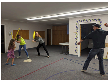
LP Belong to a Diff. Tribe