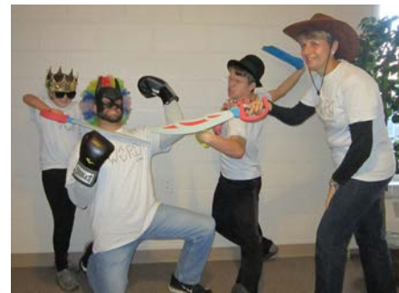
LP A Dispute