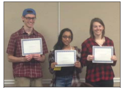
Champions: Remarkable Indeed