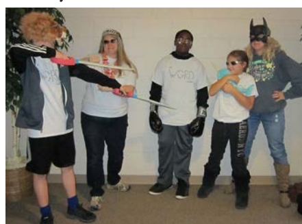
LP Why does this concern us?

LP Why does this concern us?–40, CP Puffy Shyeeep–110, LP A Dispute–30