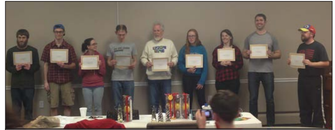
All Timers Tournament top 10 All Stars