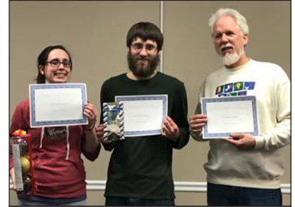
3rd place: Beauty and the Beards