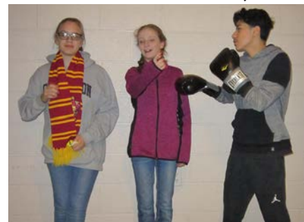
♥ 2 Small Fish