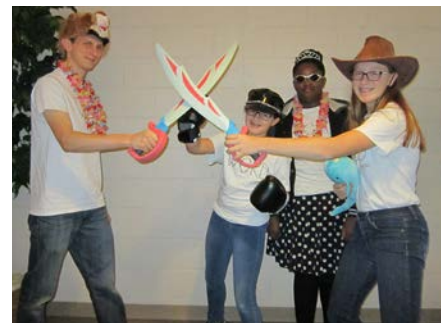
LP Do you want to leave too?