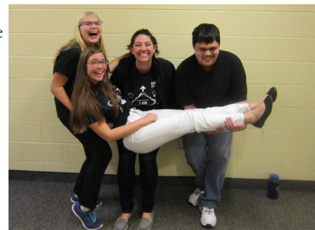
Marimont Raise It Up