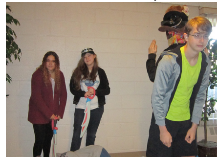
♥ About To Die