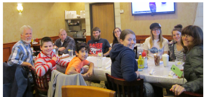
dinner at Rocky's