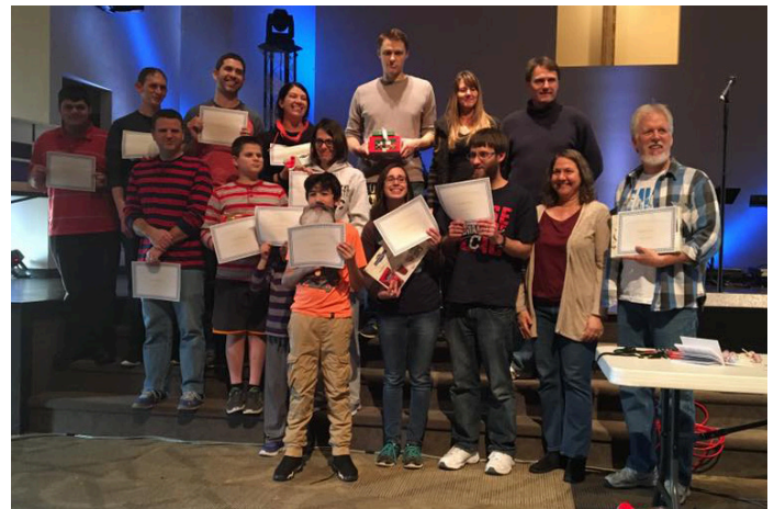
top four teams with a special celebrity guest—seemingly an unidentified member of the Duck Commander clan