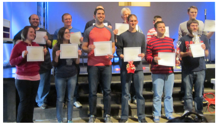
All Timers 2017 All Stars —the top 12 of the Individual Results