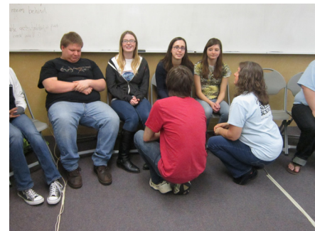
Heart in a time-out at Great Lakes