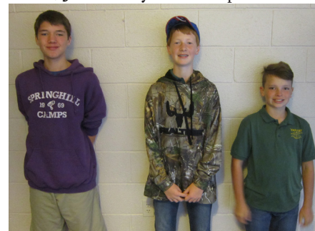
OCS You Will Laugh