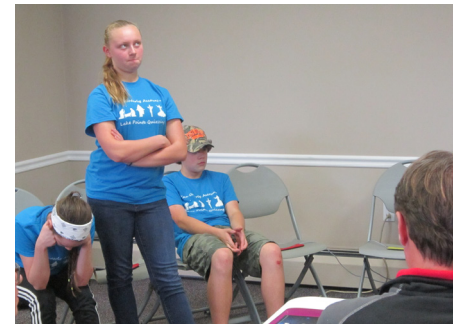
Lake Pointe in action in the Great Lakes Finals