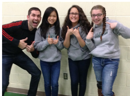
OCS Joy and Delight