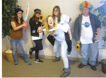
♥ Shadows of Death

♥ Shadows of Death–90, LPBC You Will Be Silent–30, Marimont Overcome by Sleep–110