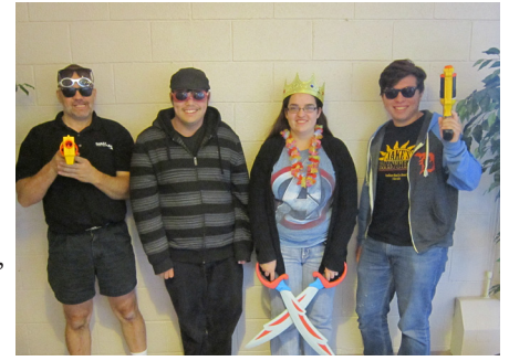
Marimont Something to Eat