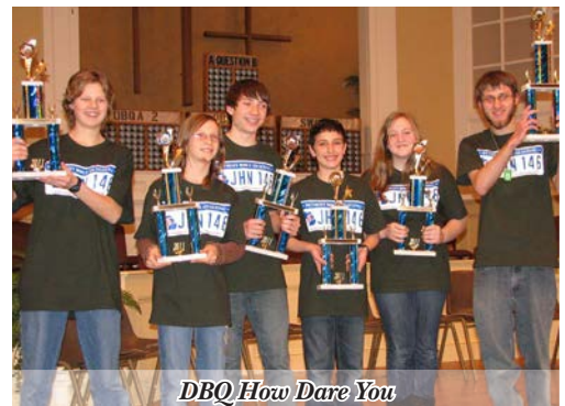
2011 JV Champions