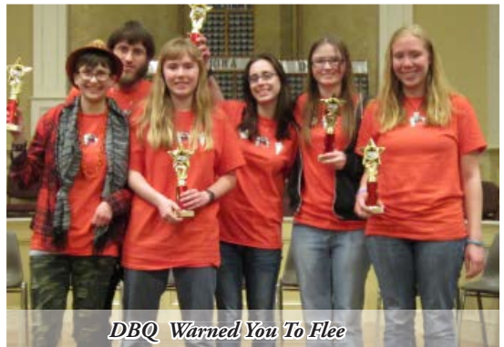
2013 Varsity Finalists—3rd Place