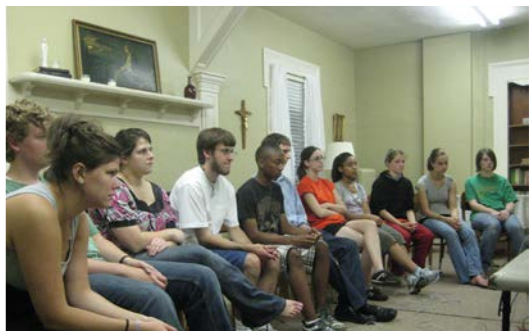
boot camp practice