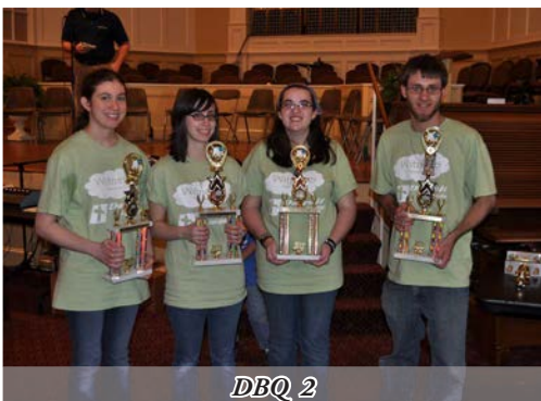
2012 Varsity Finalists—2nd Place