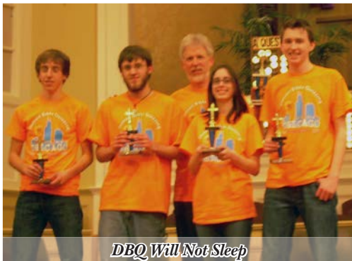
2010 Varsity Finalists—2nd Place