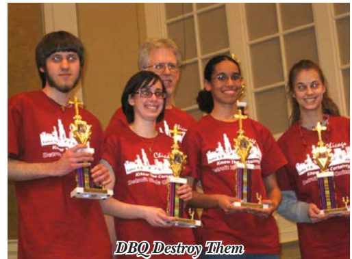
2009 Varsity Finalists—2nd Place