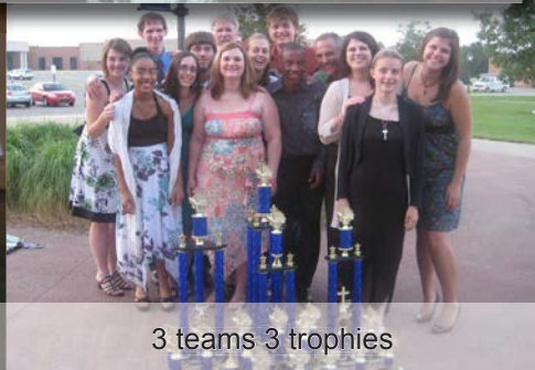
3 teams 3 trophies