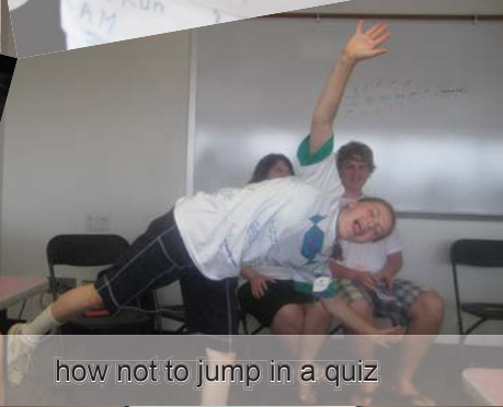
how not to jump in a quiz