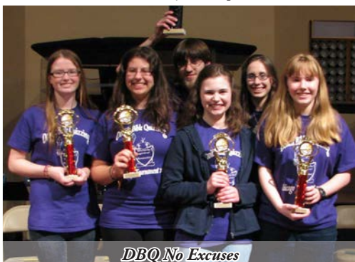
2014 Varsity Champions