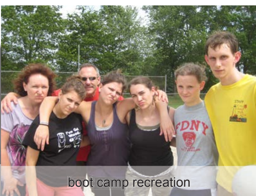
boot camp recreation