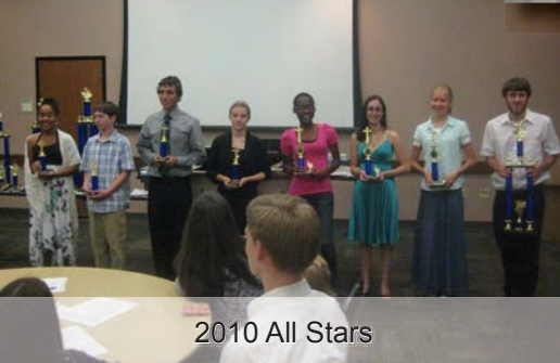
2010 All Stars