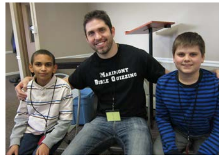
Heart, Marimont, Meadowbrook