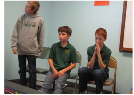
OCSword in action