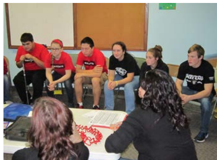
Covenant and Courageous

MCCovenant–80, MCCourageous–40, LP Galehippians–100