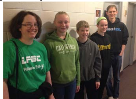
Lake Pointe’s Great Lakes delegation