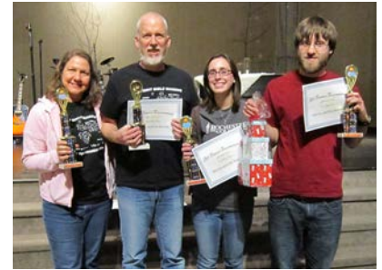
Beauty & The Beards

Five teams from Pennsylvania came to compete with 16 teams from southeastern Michigan for the 8th Annual All Timers Tournament. After a full day of quizzing, Beauty & the Beards and Our Struggle is Real again met in the Finals, with Beauty & the Beards getting the edge for their repeat championship. A good time was had by all. See page 5 for more coverage of this unique and fun tournament.