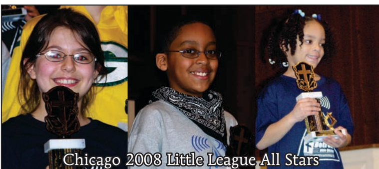
Chicago 2008 Little League All Stars

A big thank you to everyone who put in time and effort to make this awesome tournament happen.