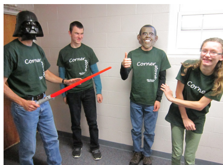
CEPC Wall of Hostility

True Worship—20, ♥ I Fear for You—130, CEPC Wall of Hostility—60