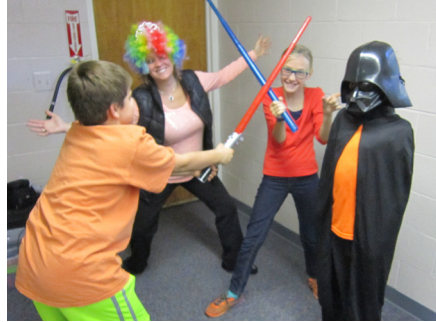
MB One in Spirit