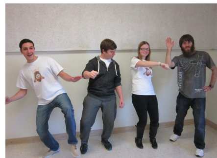
♥ I Fear for You