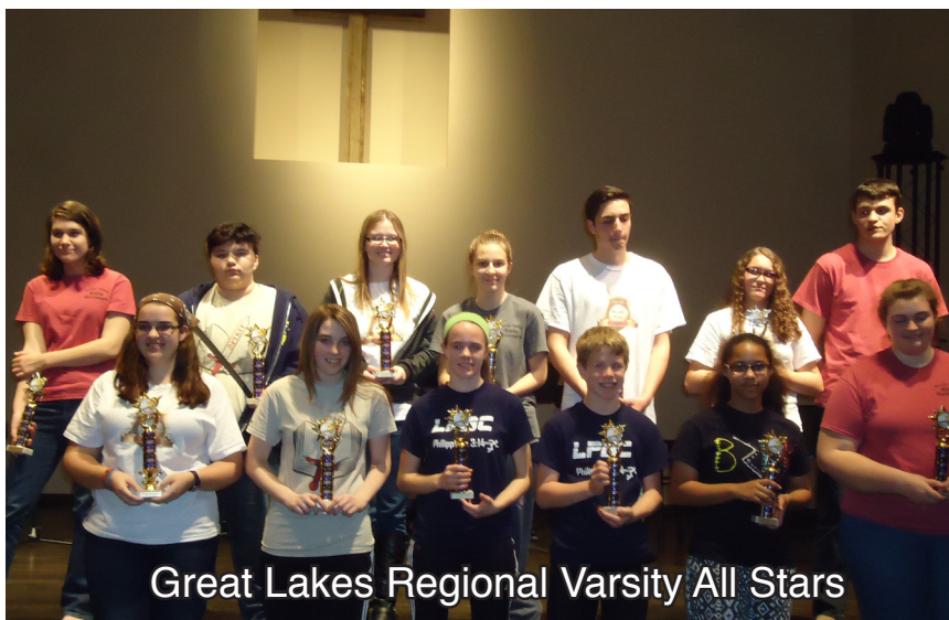
Great Lakes Regional Varsity All Stars