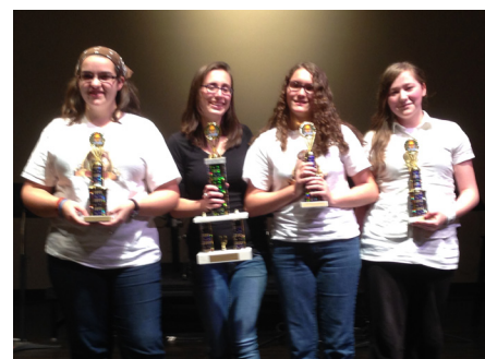
DBQ ♥ Destroy Them

It was a great end to a great day of quizzing.