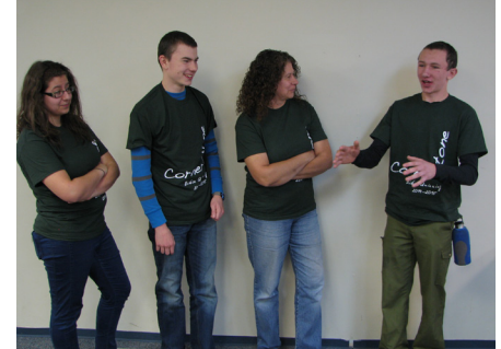
CEPC Greatly Annoyed