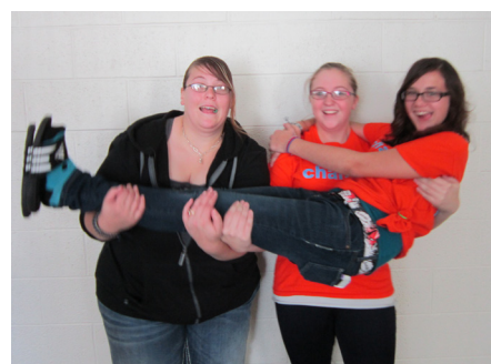
CMC Flesh is Hostile