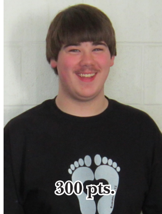
Nicholas Skelton ♥ Revelation