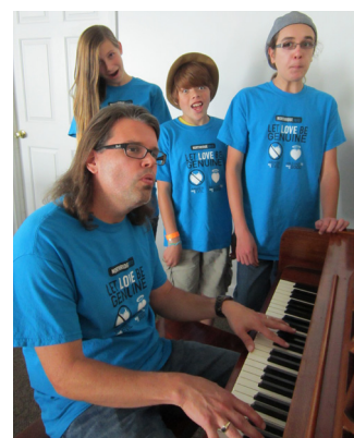
Northridge No Condemnation