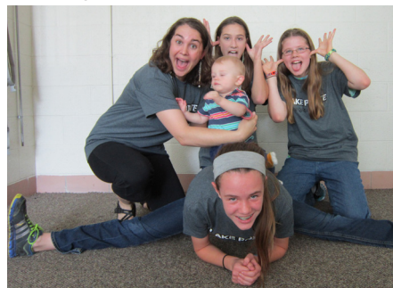
Lake Pointe The Propitiation

NC Judgment—20, CMC Flesh is Hostile—80, LP Propitiation—110