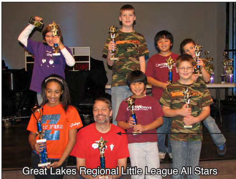
Great Lakes Regional Little League All Stars