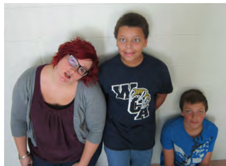
CMC O' Man

LP Propitiation—40, CMC O' Man—20, LP Hold Fast—80