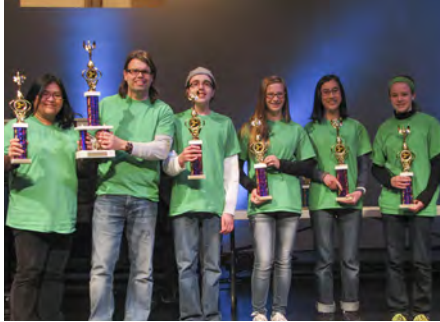
DBQ NC Avengers