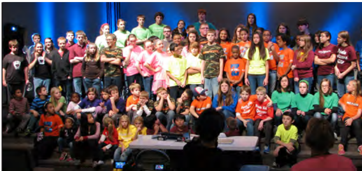
◆ 2013 Great Lakes Regional Tournament Varsity, JV and Little League group photo

See pages 5-6 for full coverage of the results and of the Varsity and JV finals.