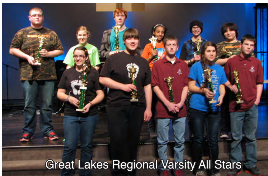
Great Lakes Regional Varsity All Stars