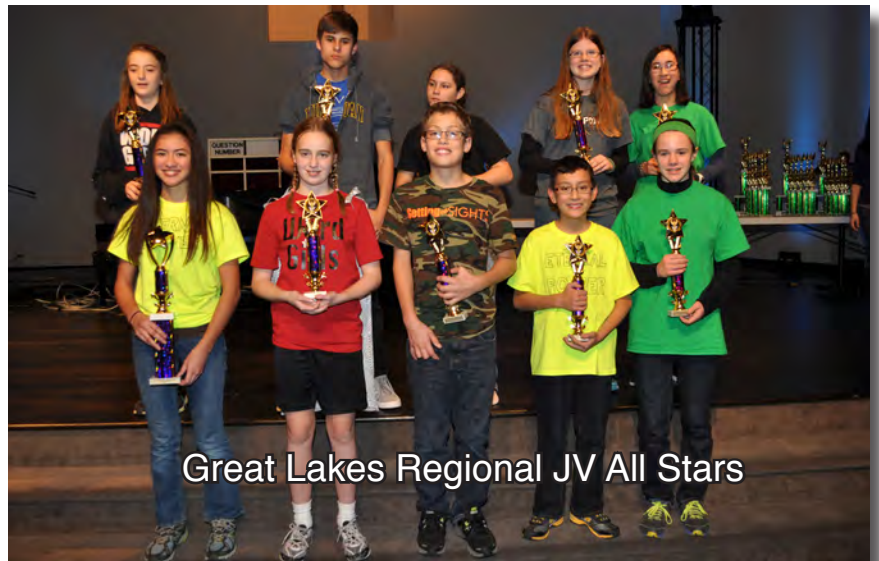
Great Lakes Regional JV All Stars