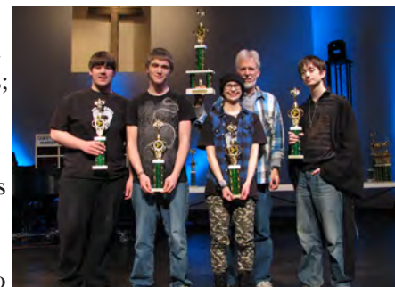
DBQ Heart Revelation

TCN got the quick jump on “Who died ...” and correctly guessed between three passages in Romans 1-8. That gave them the come-from behind victory and kept them undefeated for the day—worthy champions!