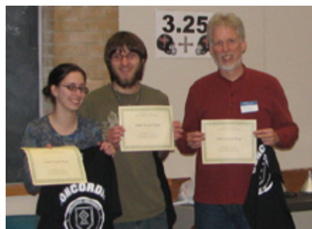
Beauty and the Beards