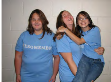
CM Awesomeness & Attractiveness

CM Awesomeness & Attractiveness–60, CP Branches–70, NC What do you want?–80