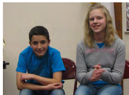
DBQ ♥ Burninators

Berrien never trailed in winning the Junior Varsity Finals. However, Cornerstone was able to tie for the lead at a couple points to make it a great quiz.