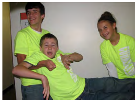
Cornerstone Presbyterian Being Pruned