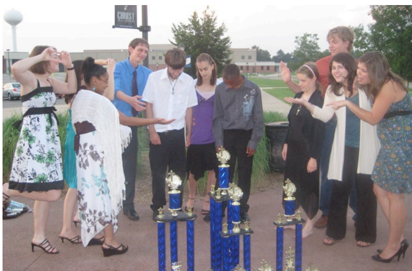
The runner-ups make sure the champs understand humility.

One thing I would say to people who will continue to quiz is this: We know quizzing is a competition where there are winners and losers. And just as with anything that glorifies God, the enemy doesn't like to see it and will try to distort or twist it in any way possible so we will try and focus on our own glory instead of God's. We all face temptations when we quiz. It's different for everyone, whether it's discouragement ("I know I can't beat so-and-so, so why bother?"), apathy, a win-at-any-cost attitude, or hardest of all—at least for me—getting you to focus on the quizzing more than the meaning of the Scriptures. Or maybe for you it's something else. We all have some temptations, and we probably all know what ours are. But remember that winners and losers in quizzing don't necessarily correspond to winners and losers in point totals. The true winners are the ones who, in the end, can overcome their temptations, put their focus on God, and try their best to give him his due glory. ✪