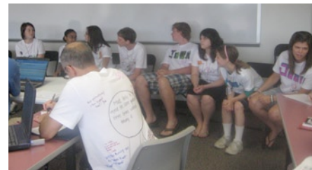
DBQ teams in uniform at the 2010 WBQA Finals Tournament.

If there are not enough quizzers available at your church, combining with some quizzers from another church is a great way to go—it can result in new friendships and will reinforce that we quiz with each other not against each other. ☪