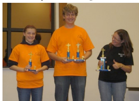
DBQ CP Fools 4 Christ

Whole Batch of Dough ended with a third-person jumping bonus and a freebie for a strong second place finish.