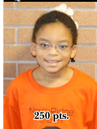
Little League Quizzer of the Month