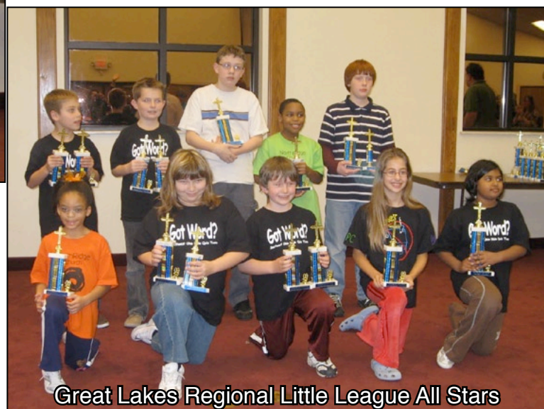
Great Lakes Regional Little League All Stars