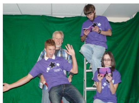
♥ Demolish Arguments

HH Weak and Sick – 20; ♥ Demolish Arguments – 210; CP LEGIT – 40