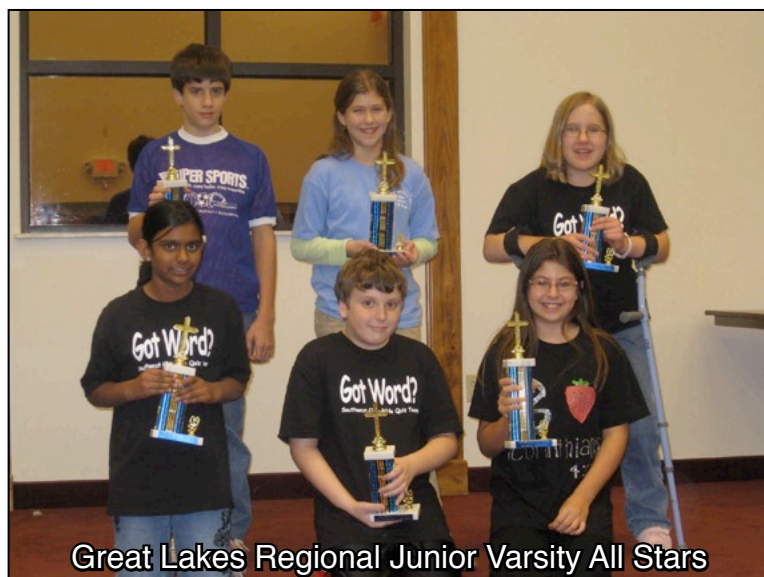
Great Lakes Regional Junior Varsity All Stars