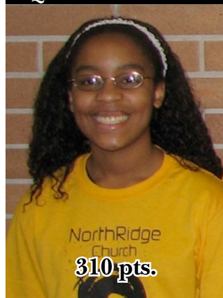
Varsity Quizzer of the Month

If you've ever wanted to get a friend involved in Bible Quizzing, here is the perfect opportunity! During our February quiz, we will be putting a special focus on "friends." We will set aside part of the day to get those friends up on the stage and trying out the pads for themselves as they compete in a fun-question quiz. We want everyone to know how much fun Bible Quizzing is—but we need YOU to help make it happen! You invite as many friends as you can think of (or anyone else you know!), and we'll make them want to come back! ☆