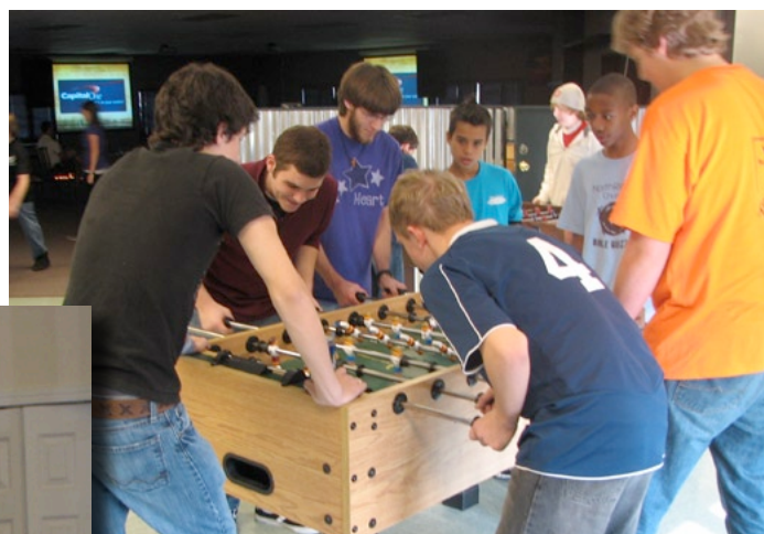
Quizzers find time for some recreation during the Great Lakes Tournament