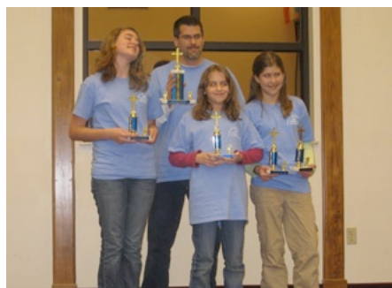
DBQ CP Dishonored

Southwest Ohio Bible Quiz Association Warriors were undefeated in the morning session and held down positions two through four in the individual ranks, so they were clear favorites in the Junior Varsity Finals. However, the DBQ teams came to quiz too, so this looked to be an exciting quiz. The teams did not disappoint.