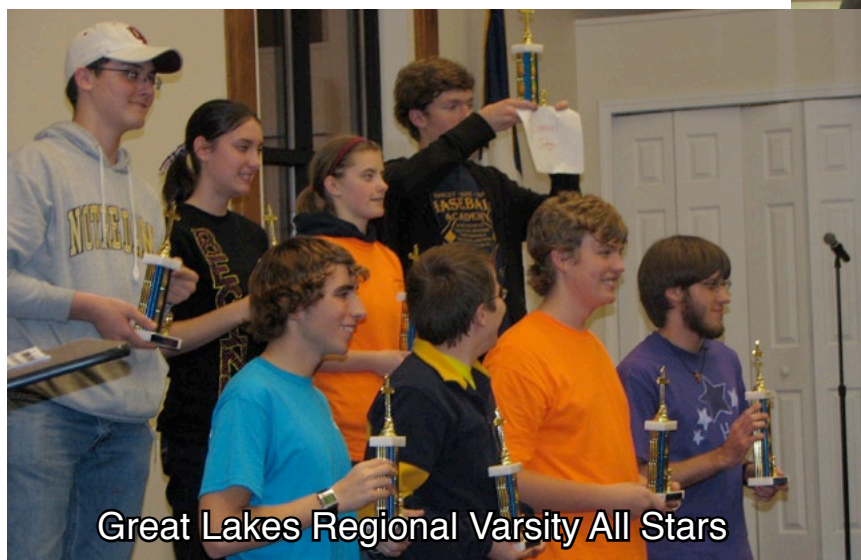
Great Lakes Regional Varsity All Stars