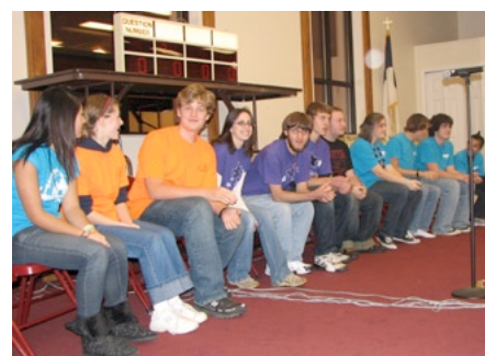
Varsity Finals about to begin