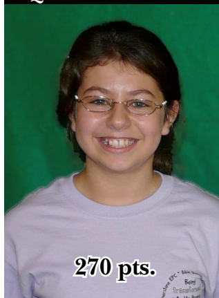
Junior Varsity Quizzer of the Month