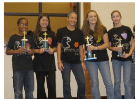
DBQ CP Hungry