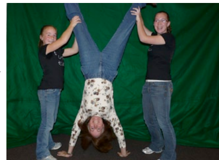
HH Fools for Christ