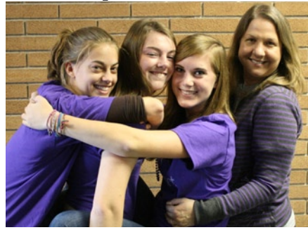
♥ Faith, Hope & Love

♥ Faith, Hope & Love – 110; Berrien Futile – 0; CMC Spiritual Seeds – 60