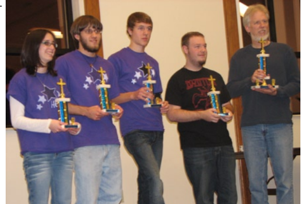
DBQ ♥ Demolish Arguments

Congratulations to DBQ Heart Demolish Arguments on bringing home the championship in the Varsity Division at the Great Lakes Regional Tournament on November 21. Congratulations to all the teams and individuals that participated. More news and stats from the tournament will be included in the December newsletter. A good time was had by all. And thanks to all the quizmasters and other volunteers and of course to Cornerstone EPC for hosting.