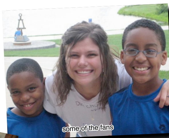
some of the fans