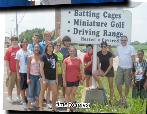
time to relax