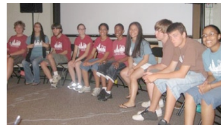
Three DBQ teams in uniform take the championship and two runner-up spots at the 2009 WBQA Finals .

More about DBQ's exploits at the WBQA Finals are on the inside pages. ☘