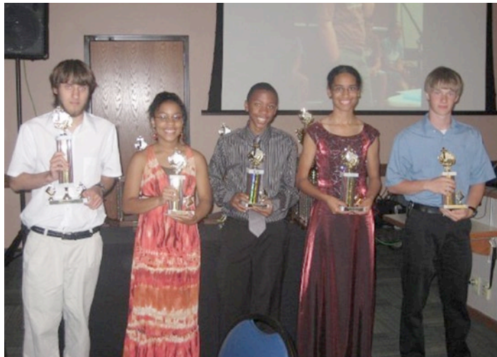
above: 2009 Top Five