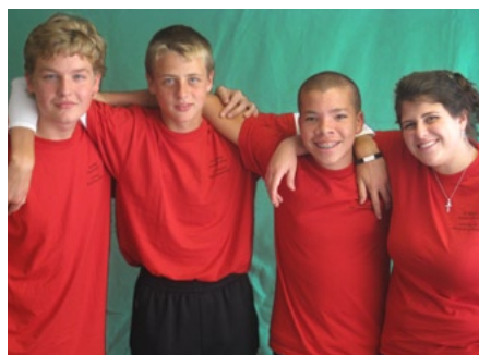
CP Buy A Sword