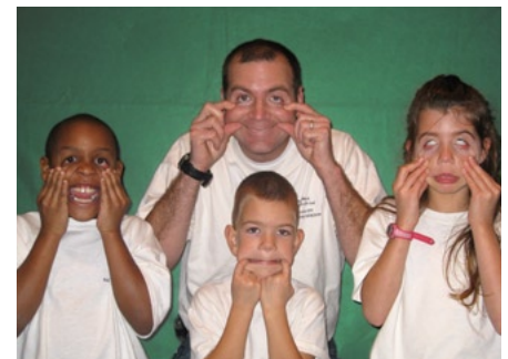
CP Fire On Earth