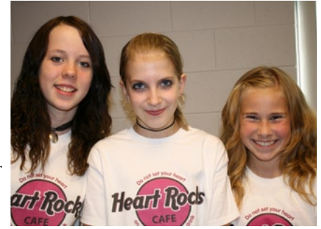
♥ Don't Be Afraid