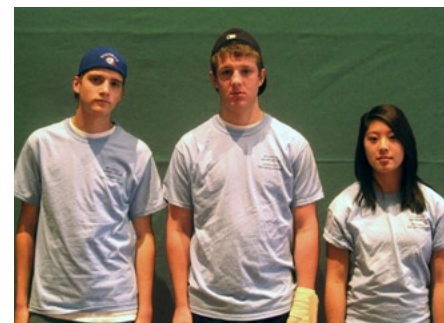
CP Yo No Se Nada