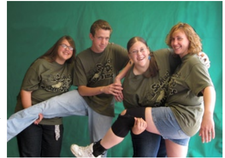
CM Lightning From Heaven