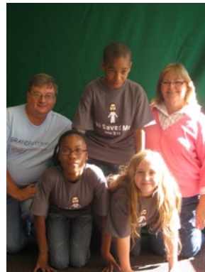
CM Love 4 N M E E

FC Don't Cry –60; CM Love 4 N M E E – 0; CP Ask for a Fish – 70