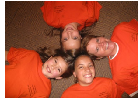
CP Quote This