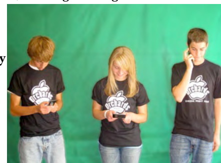
OC Someone Might Argue