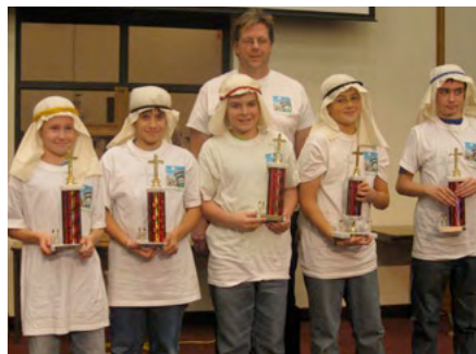
JV Champs—DBQ Cornerstone Shepherds