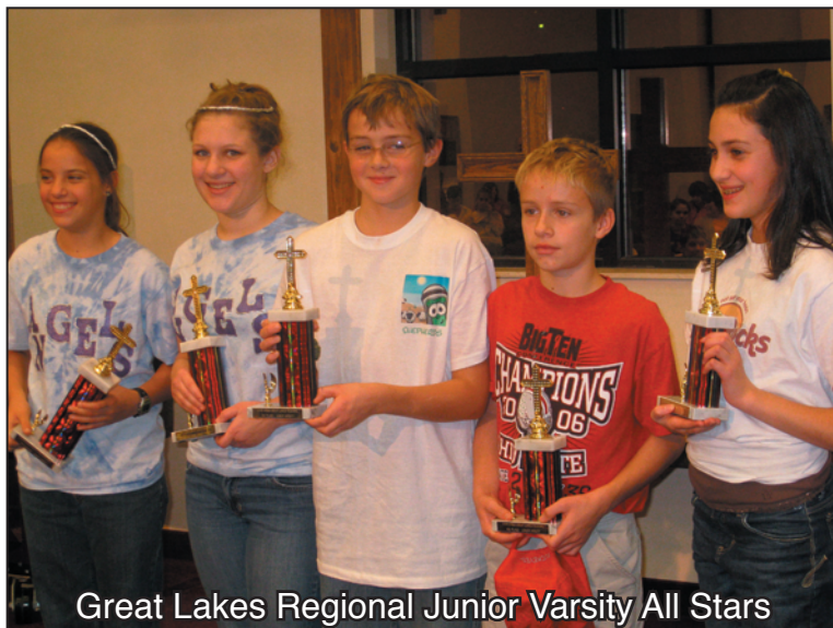
Great Lakes Regional Junior Varsity All Stars

SWOBQA Destined – 30 SWOBQA “Jesus” That’s My Final Answer – 90 DBQ Cornerstone Yeast – 140