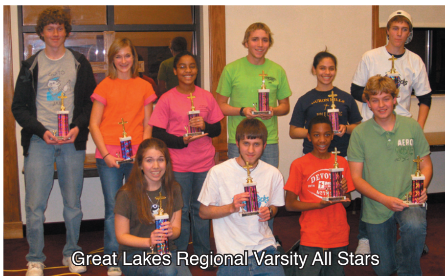
Great Lakes Regional Varsity All Stars

DBQ Heart Be Quiet – 120 DBQ FC Save Yourself – -30 DBQ Cornerstone's Blind – 130