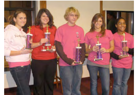
Varsity Champs—DBQ Cornerstone Blind