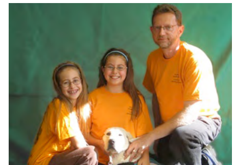
CP You Will Laugh