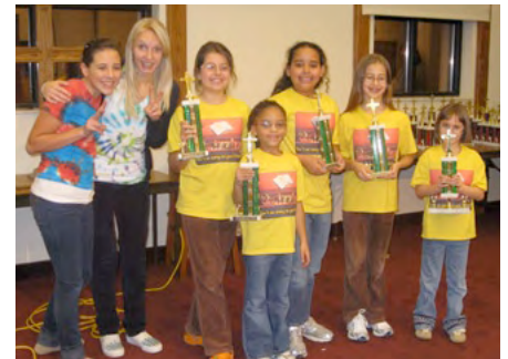
LL Champs—DBQ Cornerstone Yeast