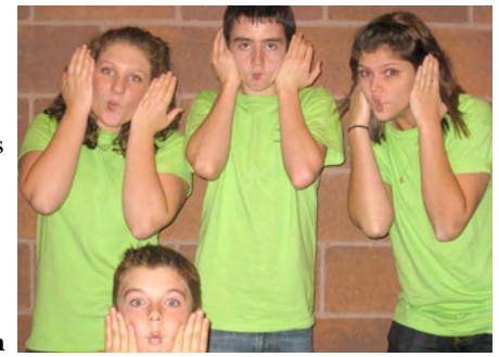
CP Asks for a Fish