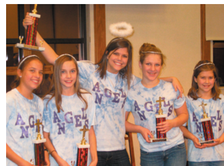
DBQ Cornerstone Angels

DBQ Cornerstone Angels – 70 DBQ Cornerstone Shepherds – 100 DBQ Heart Be Clean – 10