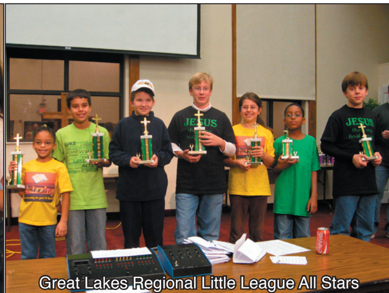
Great Lakes Regional Little League All Stars