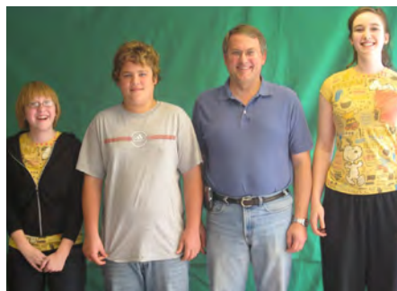
HC Together Again

CP Buy a Sword – 50; HC Together Again – 110; LW FROGG – 70