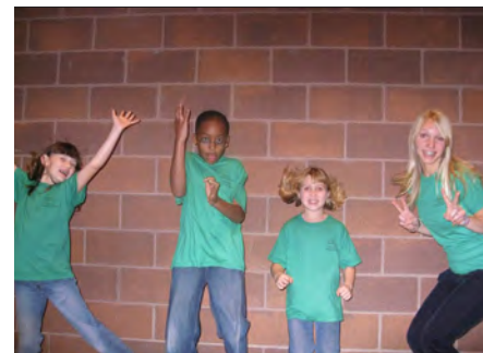
CP Jumping for Joy