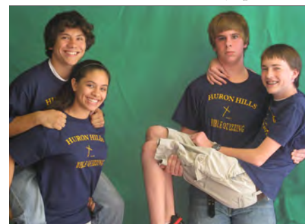
HH Blind & Lane