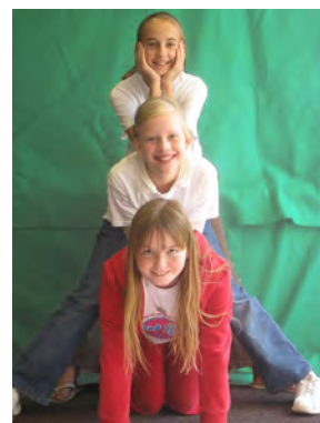
♥ Your Enemies