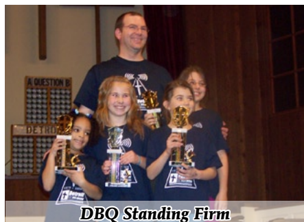
DBQ Standing Firm