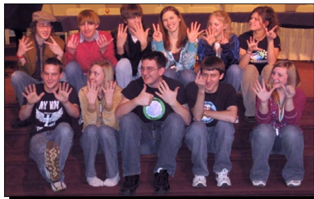
left: Senior Class of 2008— all those fingers (and a foot) being held up are for years of quizzing experience.