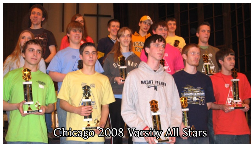
Chicago 2008 Varsity All Stars