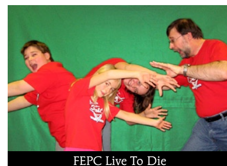
FEPC Live To Die