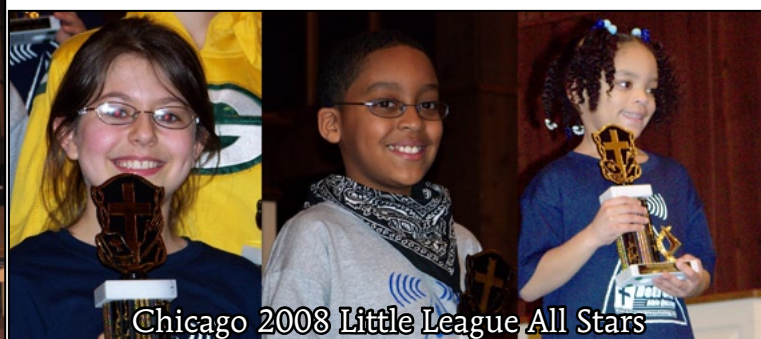
Chicago 2008 Little League All Stars