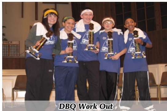
DBQ Work Out