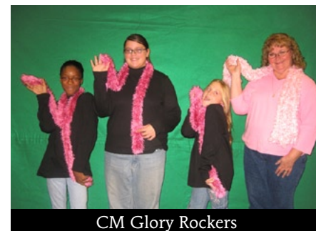
CM Glory Rockers