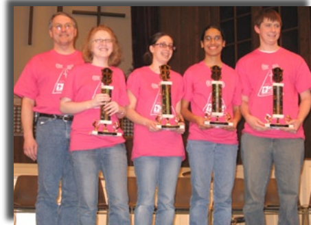
DBQ Sisters & Soldier