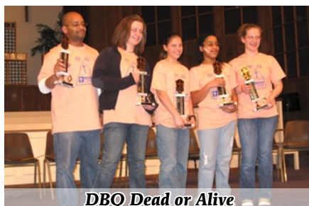
DBQ Dead or Alive