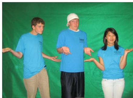
CP Yo No Sé