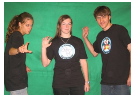
Have Faith in Heart