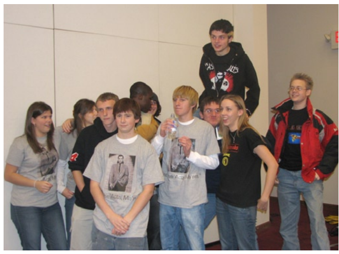
Varsity quizzers enjoying some down time