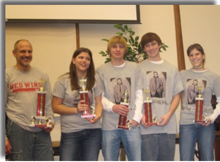
DBQ Just The 'Acts. Ma'am