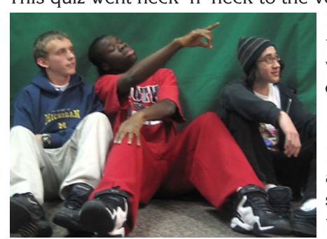
HP Known For Ages