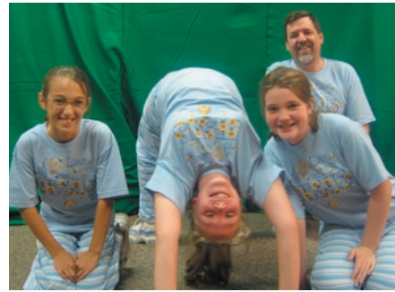
LW Praying at 3