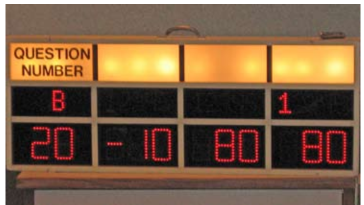
Above: The final score of the first DBQ victory at the WBQA finals. Below: A moment in time at the 2006 World Finals.