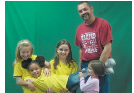
SG Bumble Bees

* Rookies need a 10-point average and veterans a 20-point average to satisfy the points qualifier for Chicago. Assuming a full season of 21 quizzes, that amounts to 210 points for rookies and 420 points for veterans.