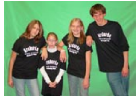
O.C. Certainly Not