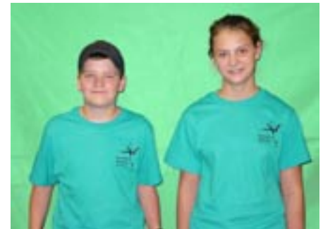
CP Wild Olives