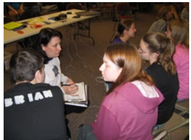
Time-out strategy sessions can be intense ... or not.