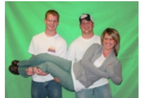
Shepherd's Gate Without Excuse