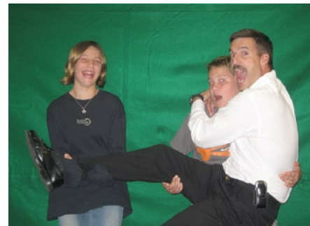
BB Free in Christ